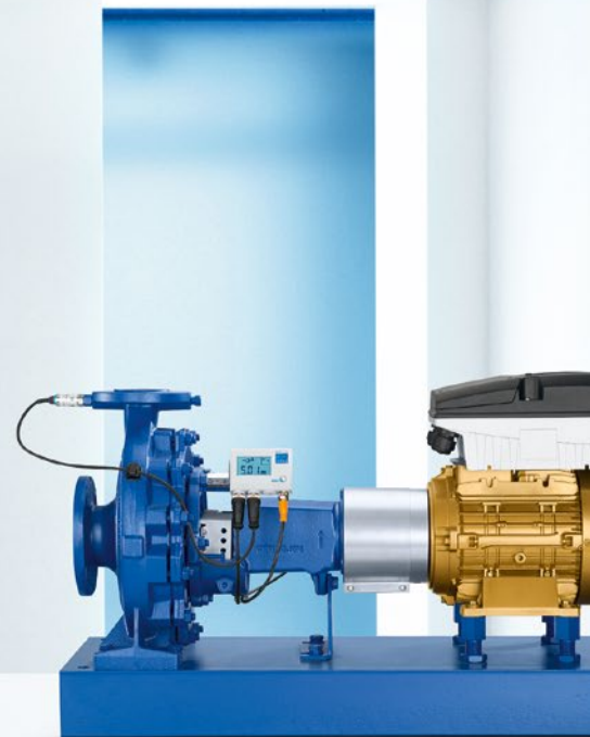
A product of perfect partnering: Etanorm

“My parents and grandparents worked for KSB, and I was determined to follow them. One great thing I find is that despite all its global activities, the company has kept a family atmosphere.”