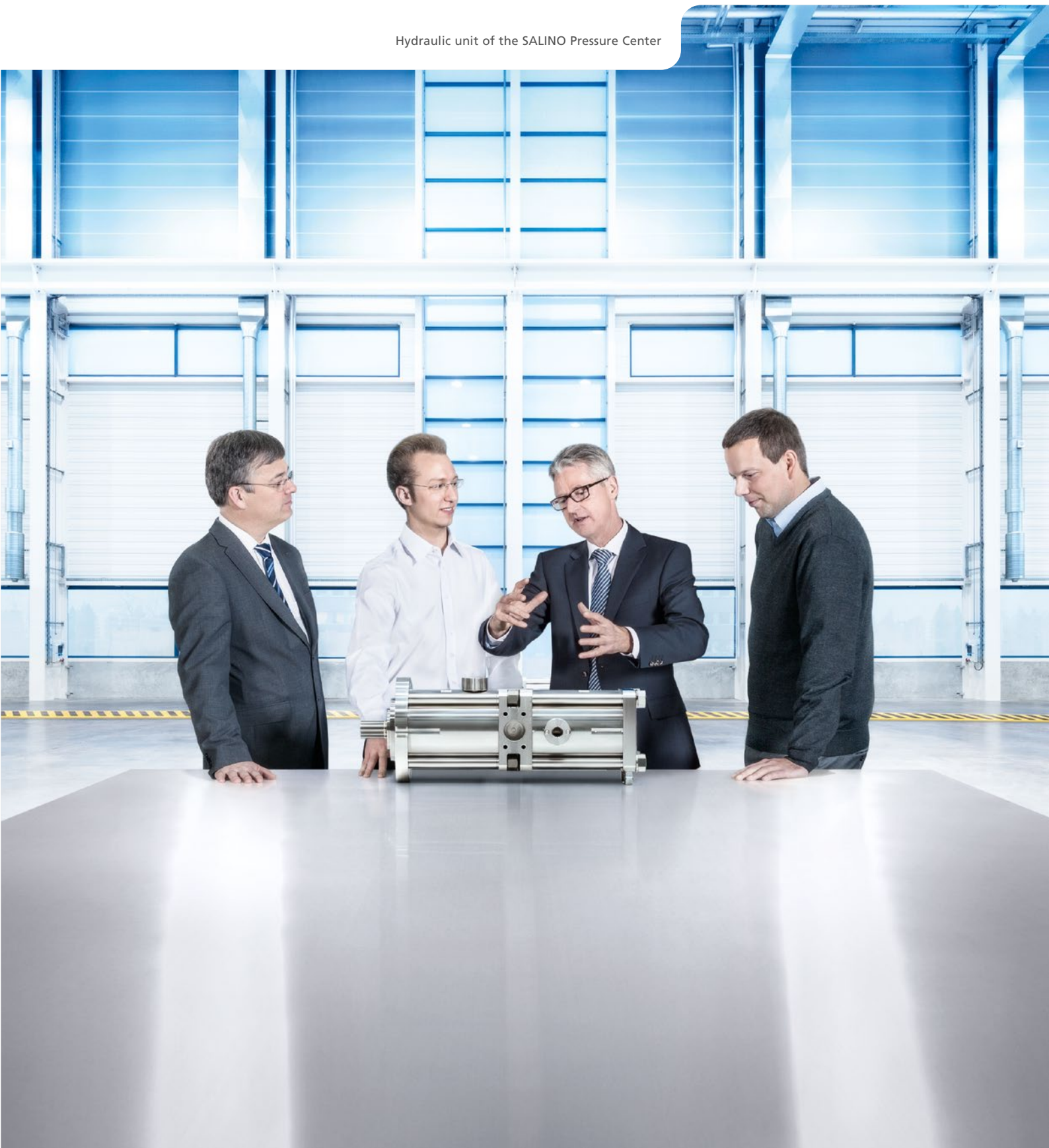
Hydraulic unit of the SALINO Pressure Center